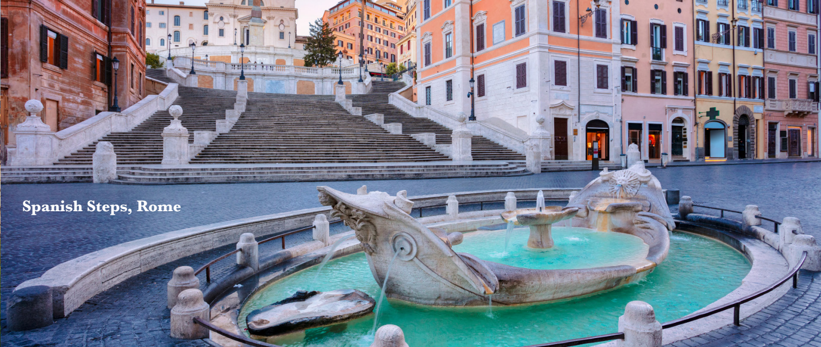
Spanish Steps, Rome