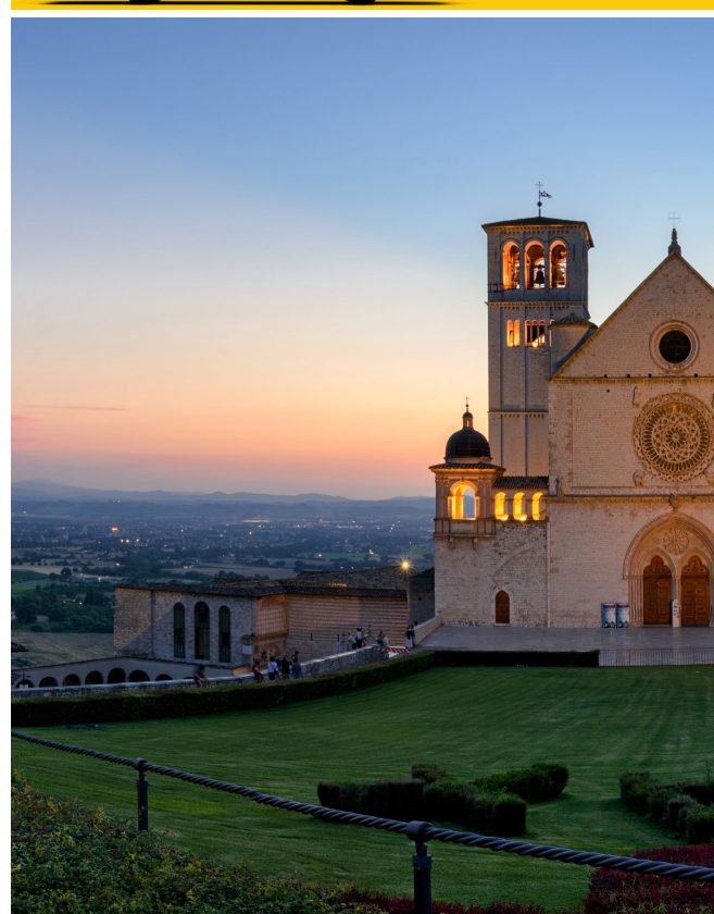
Basilica of St. Francis, Assisi