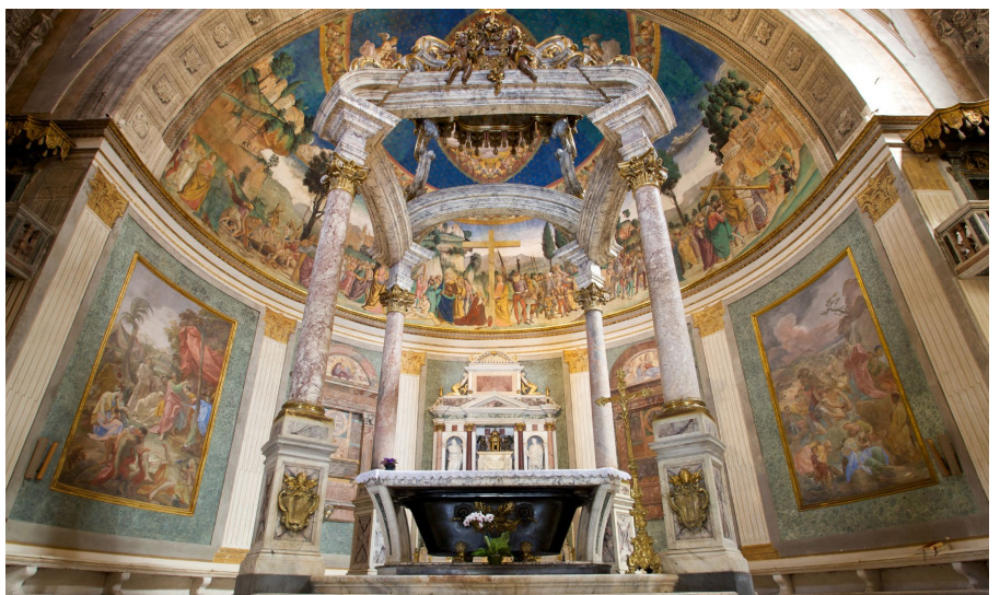
Santa Croce in Gerusalemme