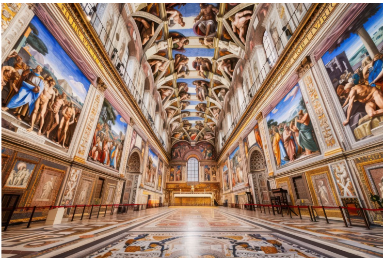
The Sistine Chapel