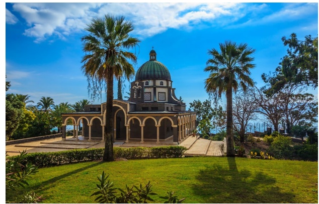
Mt. of Beatitudes Sermon on the Mount