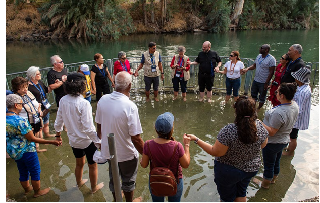
Baptism Site Jordan River

This morning, you will transfer to the airport to catch your return flight home.