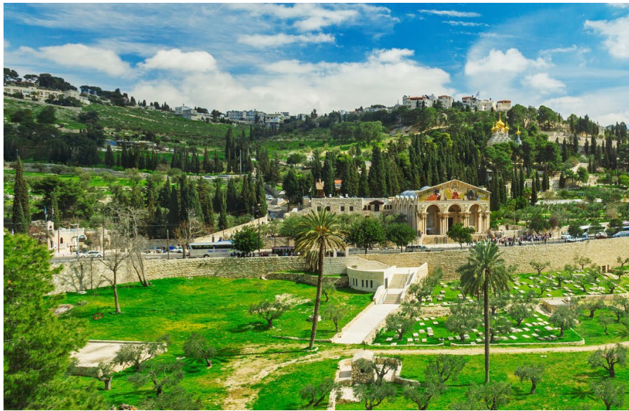
Mount of Olives Jerusalem