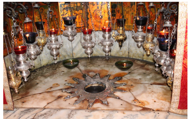
Church of the Nativity Bethlehem