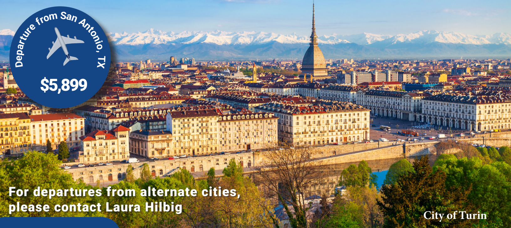
City of Turin

For departures from alternate cities, please contact Laura Hilbig