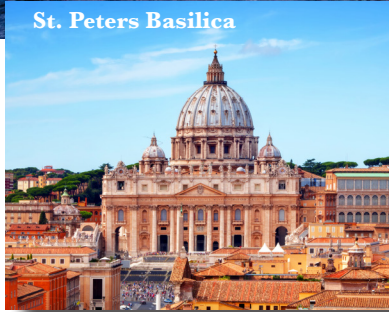
St. Peters Basilica