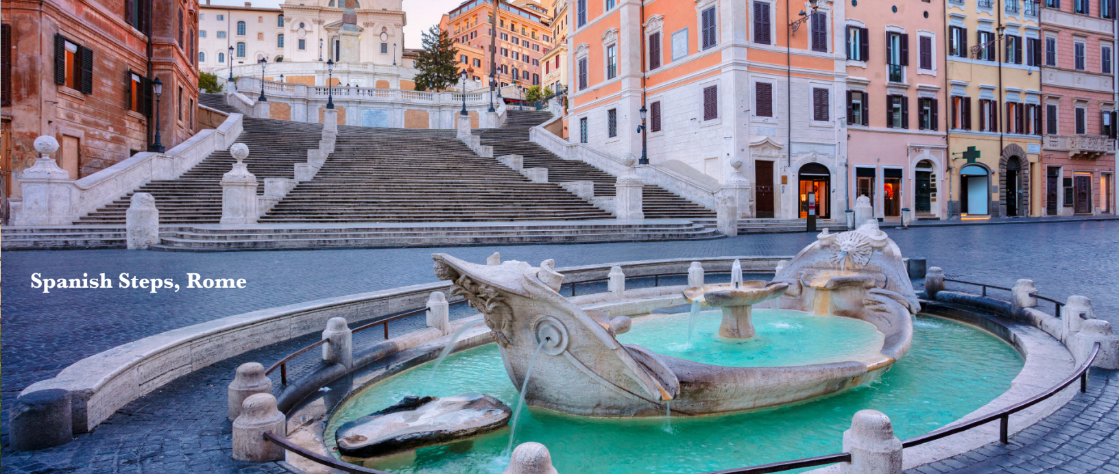
Spanish Steps, Rome