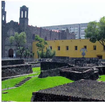
Plaza of the Three Cultures