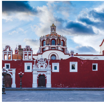
Church of Santo Domingo