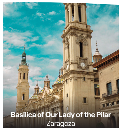
Basilica of Our Lady of the Pilar Zaragoza