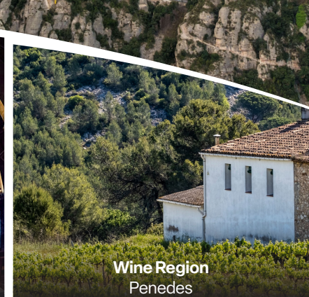
Wine Region Penedès