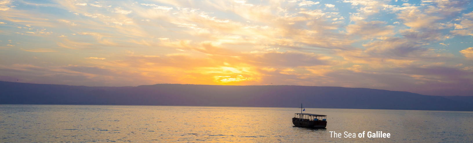
The Sea of Galilee