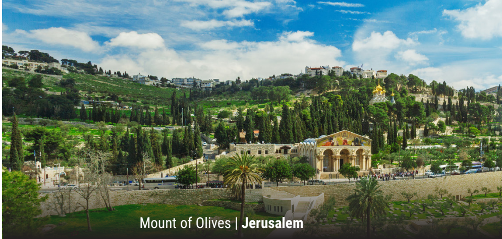
Mount of Olives | Jerusalem