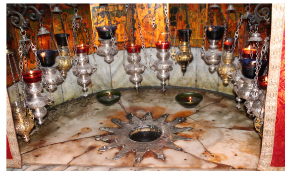
Grotto of the Nativity | Bethlehem