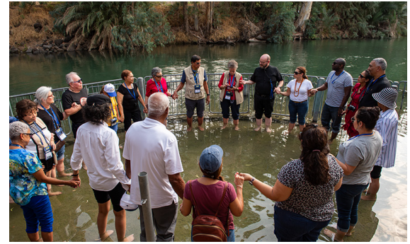
Baptism Site | Jordan River

This morning, we'll transfer to the airport to catch our flight home, carrying with us the rich experiences and memories from our uplifting journey.