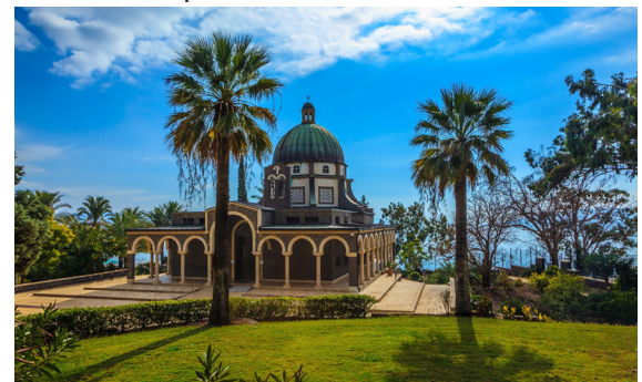
Mt. of Beatitudes