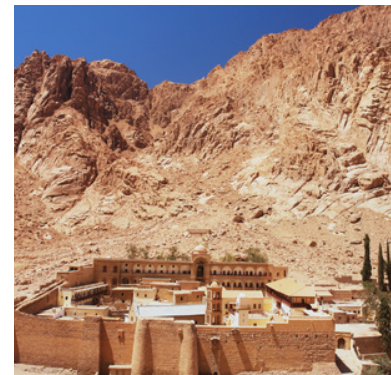
St. Catherine's Monastery Egypt

birthplace of the Virgin Mary, and the historic Ecce Homo, where Pontius Pilate proclaimed, "Behold the man!" Our final stop will be the Wailing Wall, a sacred site for the Jewish people for reflection. The rest of the day is yours to explore, shop, or relax at the hotel, followed by dinner at a local restaurant before returning to our hotel in Bethlehem.