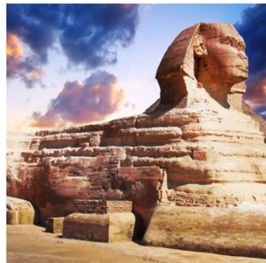
The Sphinx Egypt