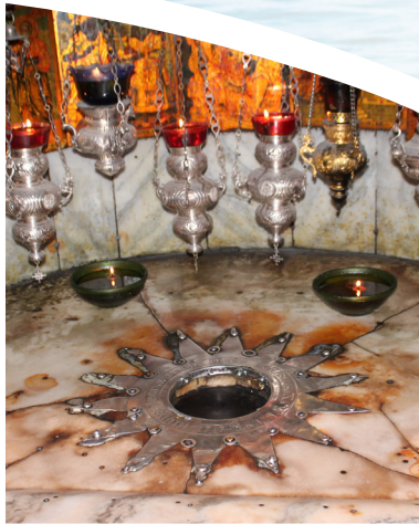
Church of the Nativity Bethlehem