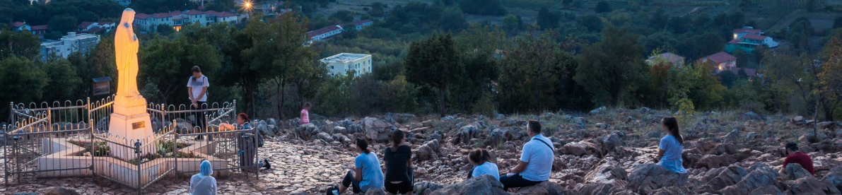
Apparition Hill, Medjugorje Bosnia and Herzegovina