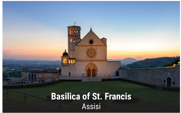
Basilica of St. Francis Assisi

This morning, we will transfer to the airport to catch our return flight home.