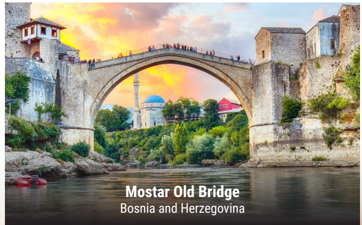
Mostar Old Bridge Bosnia and Herzegovina