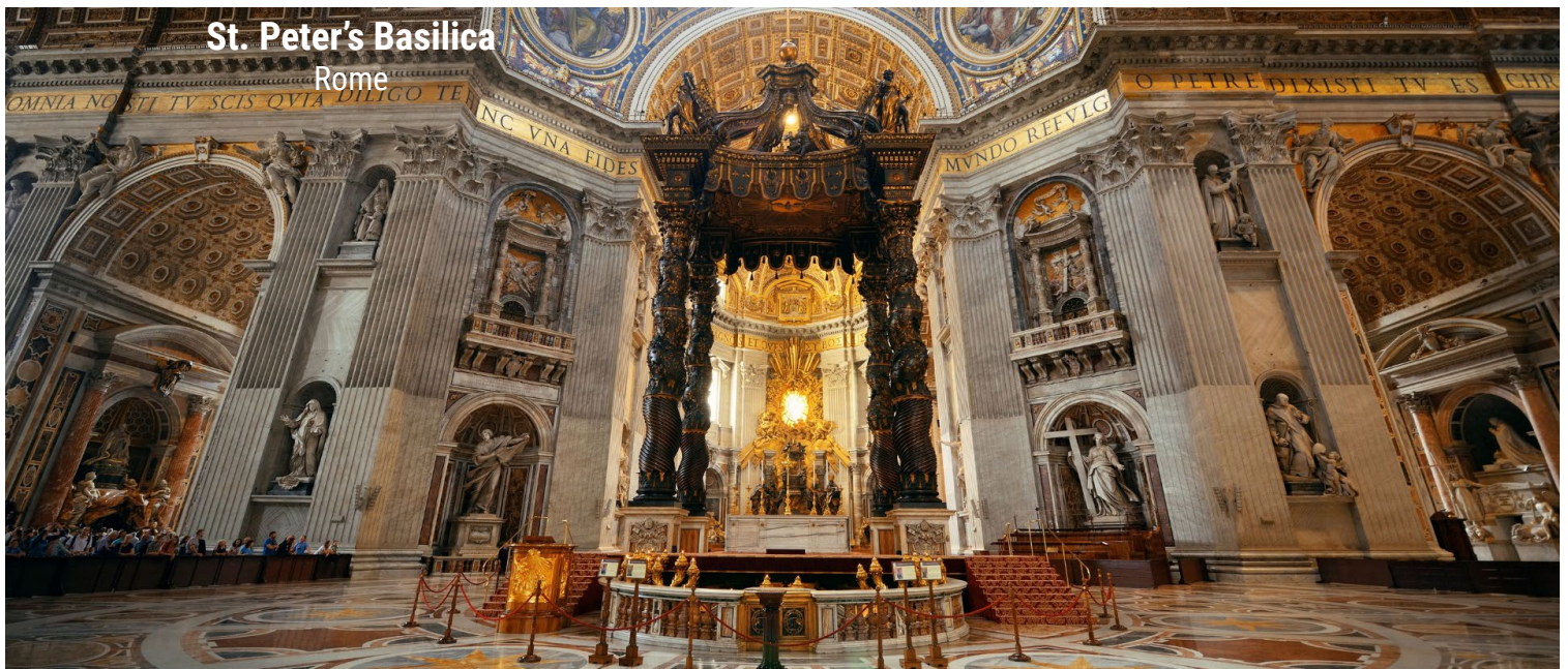
St. Peter's Basilica Rome