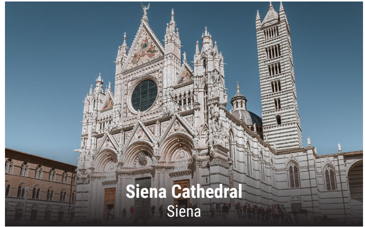
Siena Cathedral Siena