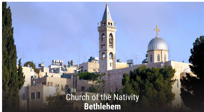
Church of the Nativity Bethlehem

register —Submit a non-refundable $300 deposit with your registration form and passport copy to the address below or use QR code to register online. The names on the registration form and passport must match exactly, and passports must be valid for at least 6 months from the return date. Full payment is due 07/13/2026.