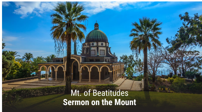
Mt. of Beatitudes Sermon on the Mount