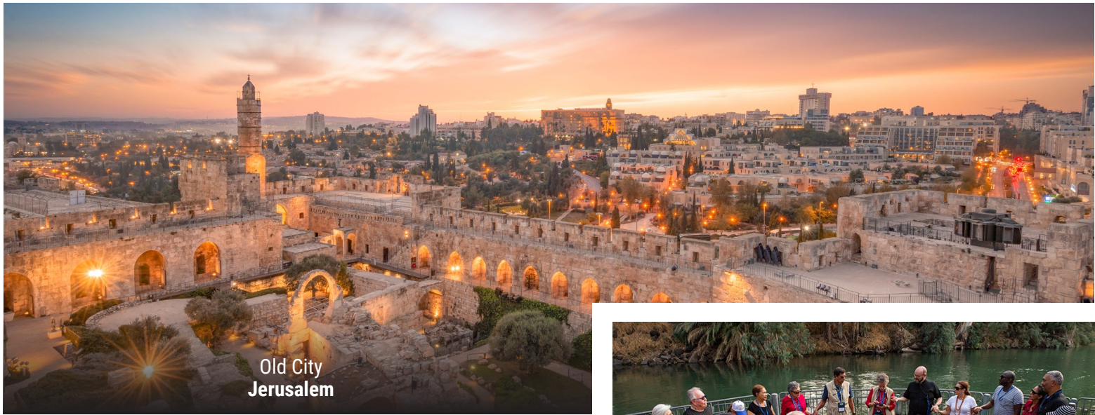
Old City Jerusalem

to renew our baptismal vows. We'll stop in Jericho, the world's oldest city, for today's Mass. Next, we'll visit the Mount of Temptation, where Jesus fasted, and Qumran, home of the Dead Sea Scrolls. Finally, we'll enjoy floating in the mineral-rich Dead Sea before returning to our hotel in Bethlehem for dinner and overnight accommodations.