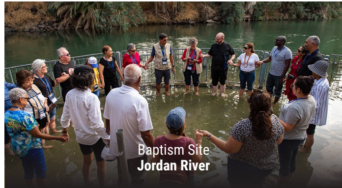
Baptism Site Jordan River

This morning, we'll transfer to the airport to catch our flight home, carrying with us the rich experiences and memories from our uplifting journey.