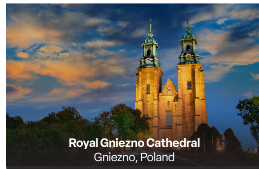
Royal Gniezno Cathedral Gniezno, Poland