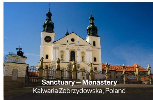
Sanctuary—Monastery Kalwaria Zebrzydowska, Poland