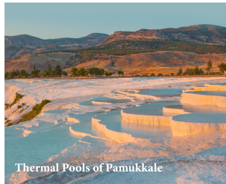
Thermal Pools of Pamukkale