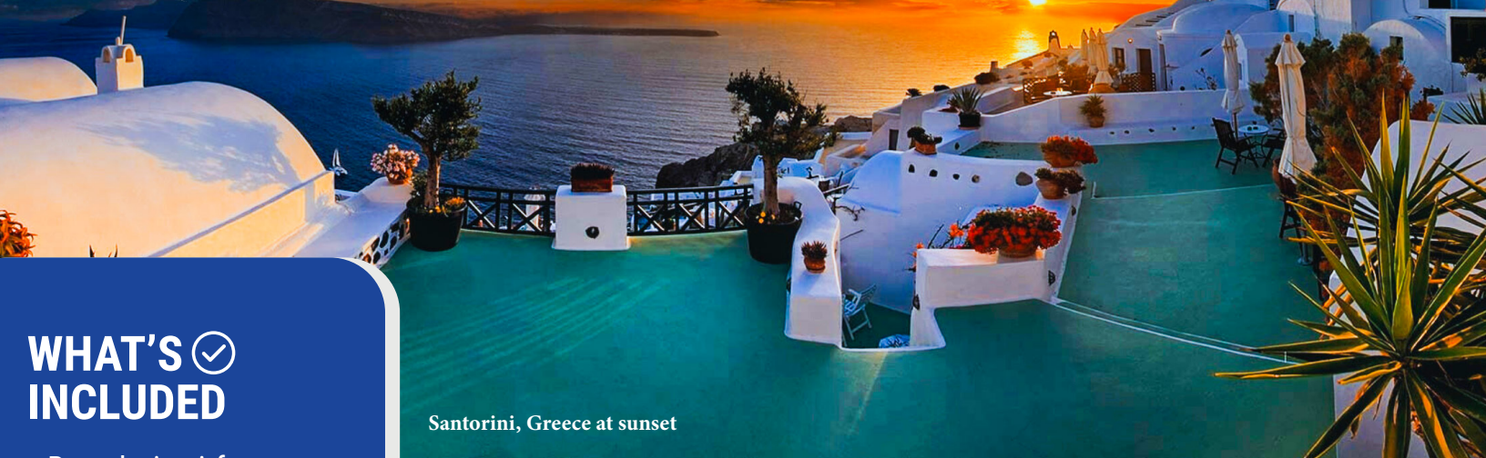
Santorini, Greece at sunset

FLIGHTS DEPARTING FROM HOUSTON, TX $5,349 per person