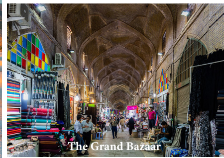
The Grand Bazaar

Fountain, the Temple of Adrian, the Celsus Library, and the Grand Theater of Ephesus! We will also visit the house of the Virgin Mary, where she spent her final days. Dinner and overnight accommodation will be at your hotel.