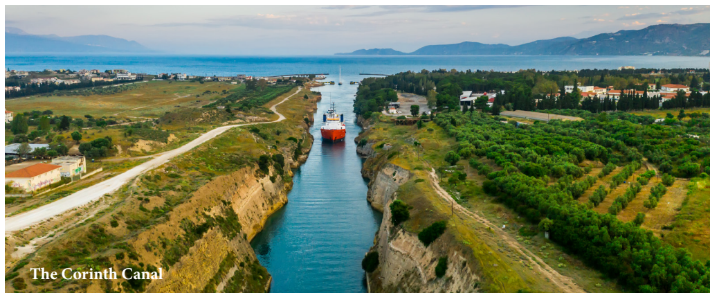
The Corinth Canal

We will transfer to the airport this morning to board our return flight home. We hope you’ve enjoyed your spiritual journey with us and hope to see you again soon.