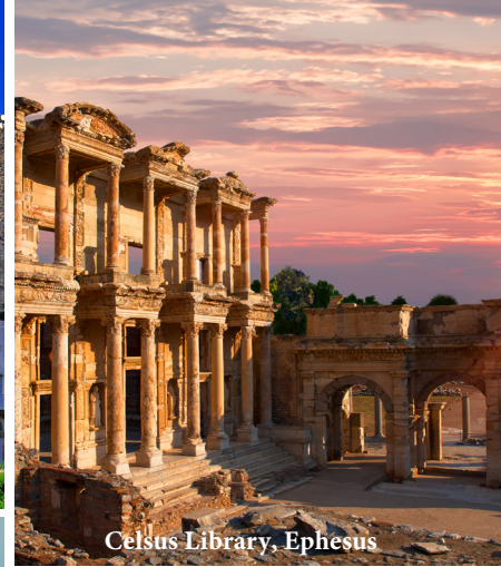
Celsus Library, Ephesus