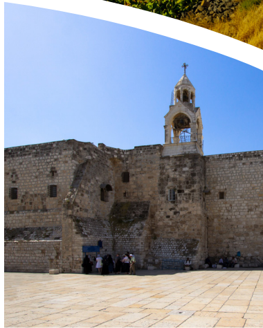
Church of the Nativity Bethlehem