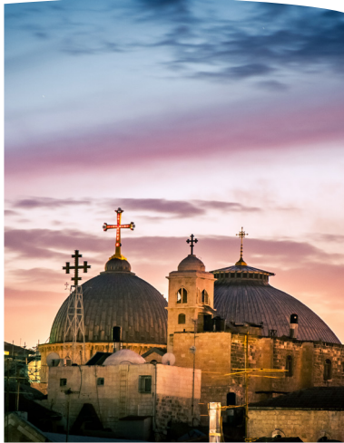
Church of the Holy Sepulchre Jerusalem