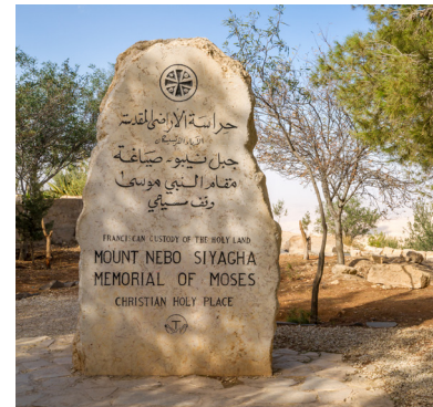
Mt. Nebo Jordan

rest of the day is free for you to explore or relax, ending with dinner and an overnight stay in Bethlehem.