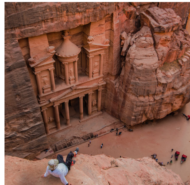
The Treasury Petra