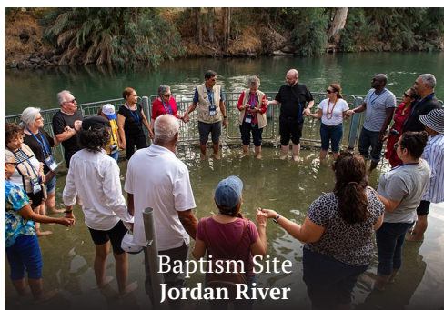
Baptism Site Jordan River

(10/21) This morning, we'll transfer to the airport to catch our flight home, carrying with us the rich experiences and memories from our uplifting journey.