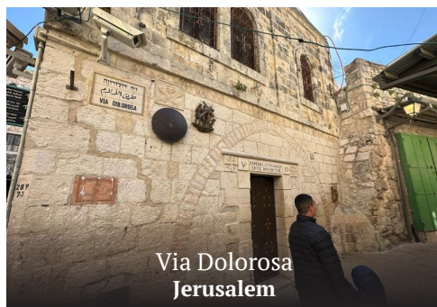
Via Dolorosa Jerusalem