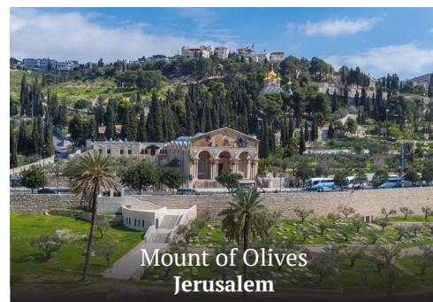
Mount of Olives Jerusalem