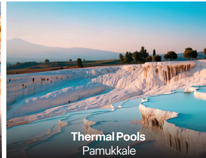
Thermal Pools Pamukkale