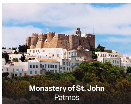
Monastery of St. John Patmos