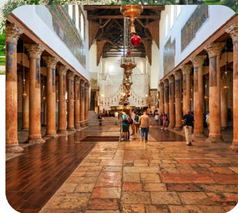
Church of the Nativity Bethlehem