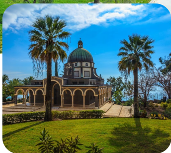
Mt. of Beatitudes Galilee