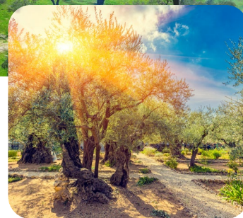
Garden of Gethsemane Jerusalem