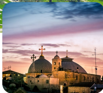
Church of the Holy Sepulchre Jerusalem