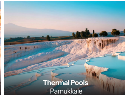
Thermal Pools Pamukkale