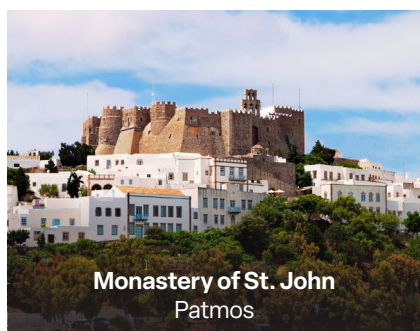
Monastery of St. John Patmos