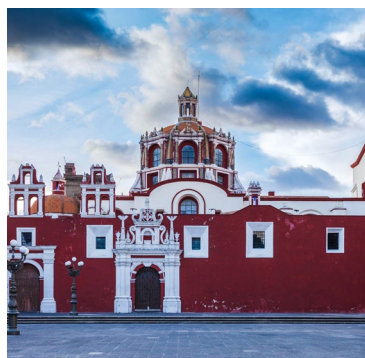
Church of Santo Domingo