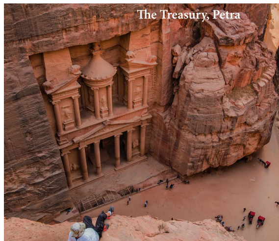
The Treasury, Petra

As our journey ends, we'll head to the airport, our hearts filled with excitement and lifelong memories.