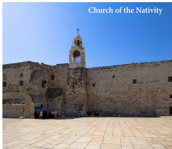
Church of the Nativity