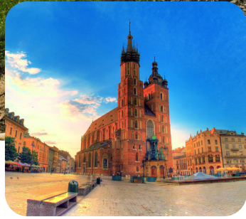
St. Mary's Cathedral Krakow