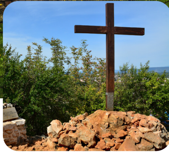
Apparition Hill Medjugorje