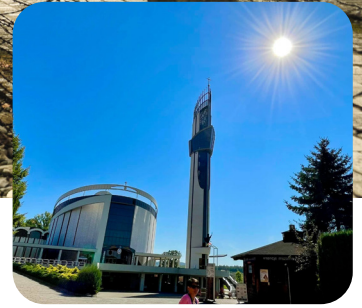
Divine Mercy Sanctuary Łagiewniki