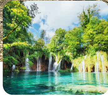
Plitvice lakes Croatia