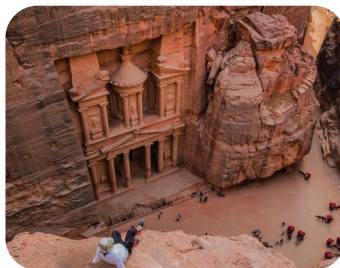
The Treasury Petra