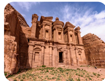
The Monastery Petra

Moses in the Book of Exodus. After our inspiring adventure, we'll head to Jordan, arriving in beautiful Aqaba for a delightful overnight stay. What an exciting day awaits!