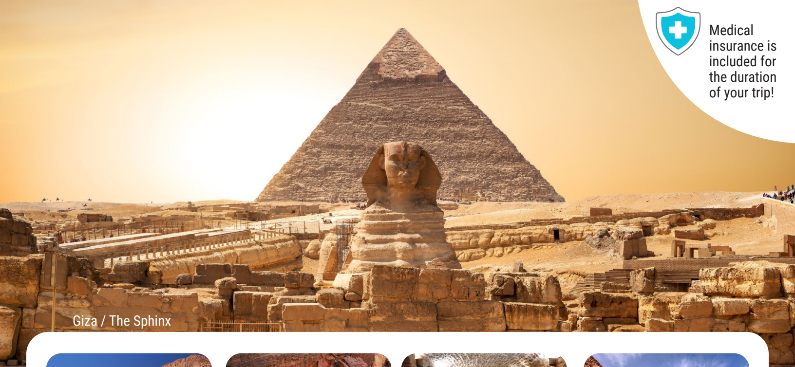
Giza / The Sphinx

Medical insurance is included for the duration of your trip!