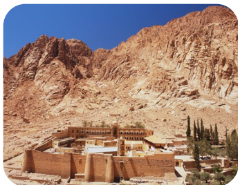
St. Catherine Monastery Sinai