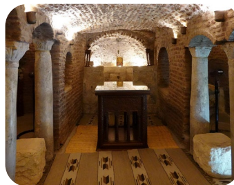
Abu Sergha Church Cairo