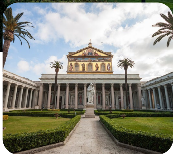
St. Paul Outside the Walls