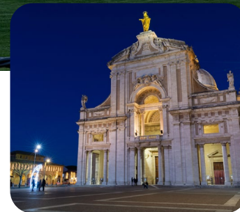
St. Mary of the Angels, Assisi

consecrated in 324 A.D. We'll join the congregation at the Anglican Centre for Eucharist/Communion, followed by lunch to share reflections. In the afternoon, we'll explore the Mamertine Prison, where Paul and Peter were held before their martyrdom, and visit the Church of San Paolo alla Regola, linked to Paul's legacy and his leather-making trade. Finally, we'll head to the serene Three Fountains Abbey, the site of St. Paul's martyrdom in 67 A.D. Dinner and overnight in Rome.