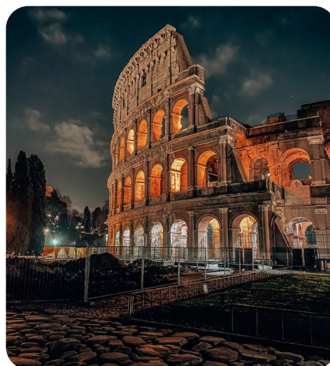
The Colosseum, Rome

We'll visit Rome's incredible religious and historical landmarks, such as St. Mary Major Basilica, St. Peter's Basilica, and the enchanting St. Sabina on the Aventine Hill. And don't forget to explore the Rosary Monastery! As evening approaches, we can either delve into the wonders of the Roman Forum or simply relax at the picturesque Piazza Navona.