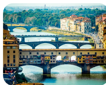
Ponte Vecchio, Florence