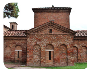
Mausoleum of Galla Placidia