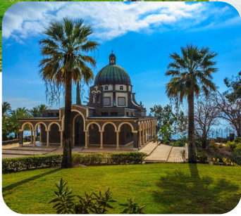
Mt. of Beatitudes Galilee