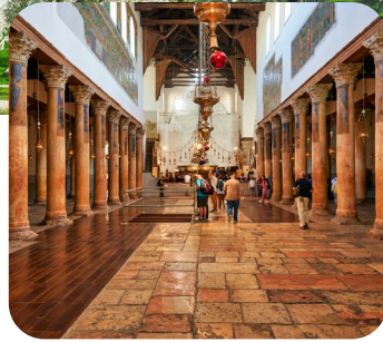
Church of the Nativity Bethlehem