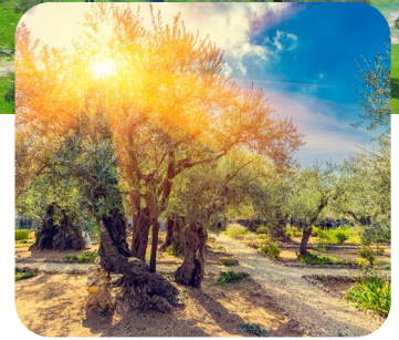
Garden of Gethsemane Jerusalem

with a delicious dinner and an overnight stay in Jerusalem.