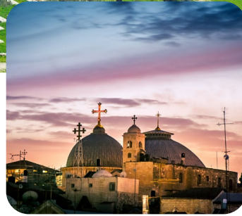
Church of the Holy Sepulchre Jerusalem