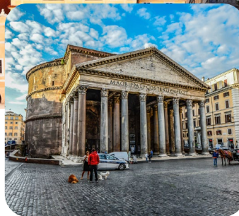
The Pantheon Rome