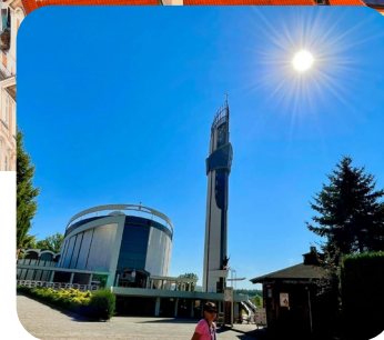
Divine Mercy Sanctuary Łagiewniki

statue. After a fulfilling day, we'll enjoy dinner and relax at our hotel.