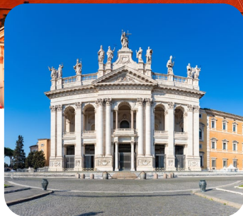
Basilica of St. John Lateran Rome