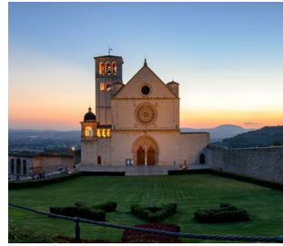
Basilica of St. Francis