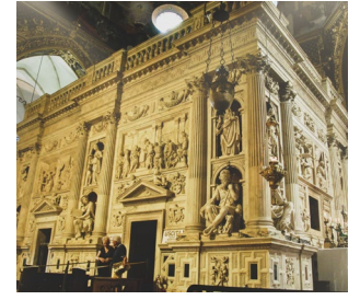
Holy House of Mary