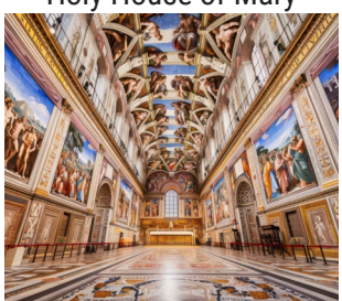
The Sistine Chapel