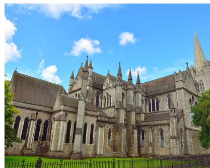
St. Patrick's Cathedral