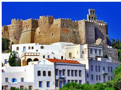
St. John Monastery, Patmos