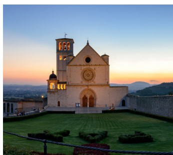
Basilica of St. Francis