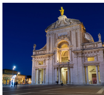
St. Mary of the Angels