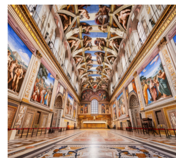
The Sistine Chapel