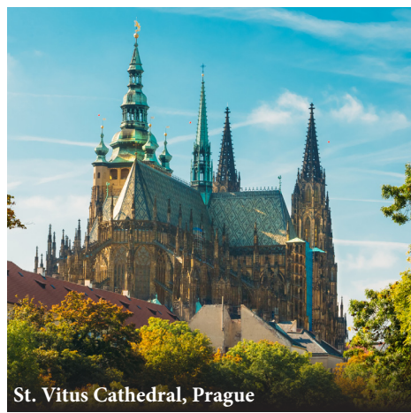
St. Vitus Cathedral, Prague