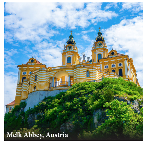
Melk Abbey, Austria