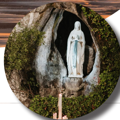
Grotto of Massabielle

revealing His Heart to her, Jesus said: “Behold the Heart which has so loved men that it has spared nothing but has been poured out totally and consumed as proof of its love”. We will visit the Shrine of Paray-le-Monial, the Chapel of Apparitions, the room of the relics of St. Margaret Mary, the Diorama of St. Margaret, and the Eucharist Museum. Mass will be celebrated. We continue to Lyon, France’s second-largest city, dramatically sited on the banks of the Rhone and Saone rivers. Dinner and overnight will be at your hotel in Lyon.