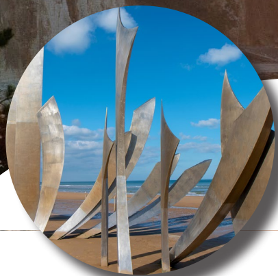
D-Day Memorial, Omaha Beach

“ An awe-inspiring pilgrimage that blends profound spiritual reflection with breathtaking journeys to sacred sites and historic cathedrals, leaving you enriched by faith, culture, and unparalleled beauty. ”