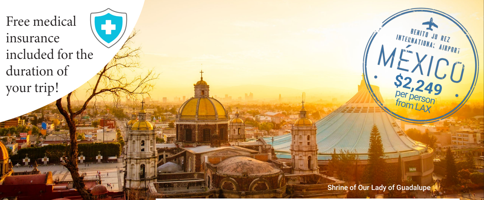
Shrine of Our Lady of Guadalupe