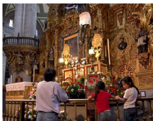
Miraculous Cross of Poison