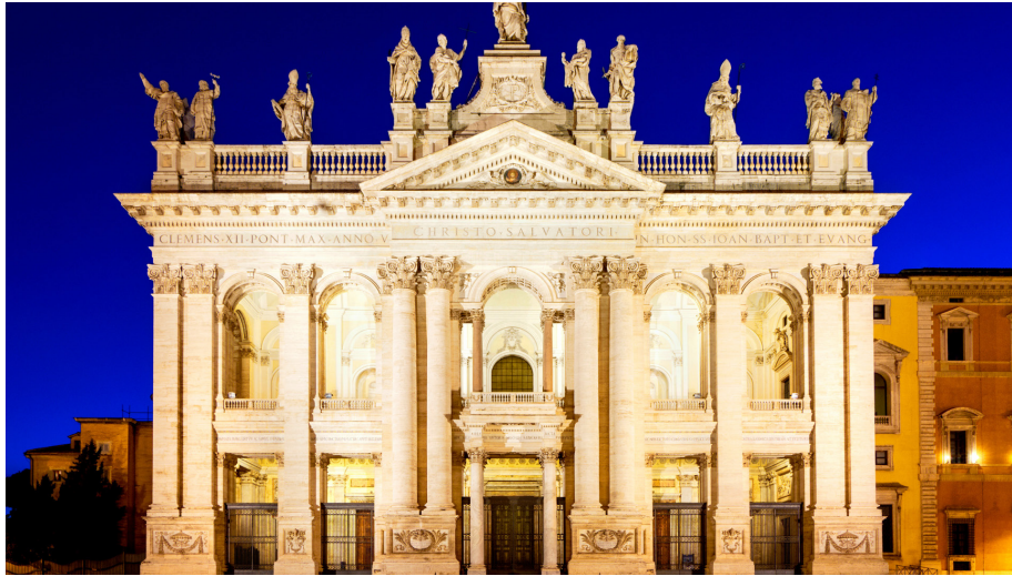
Basilica of St. John Lateran