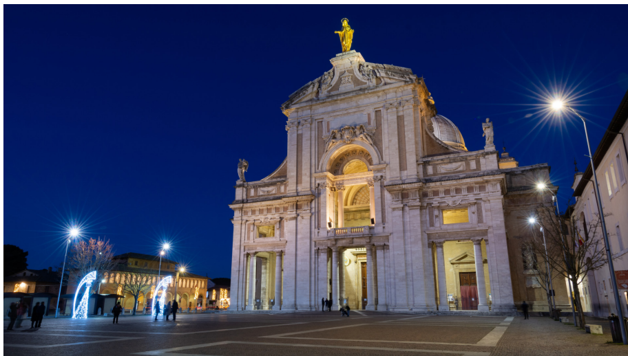
St. Mary of the Angels — Assisi