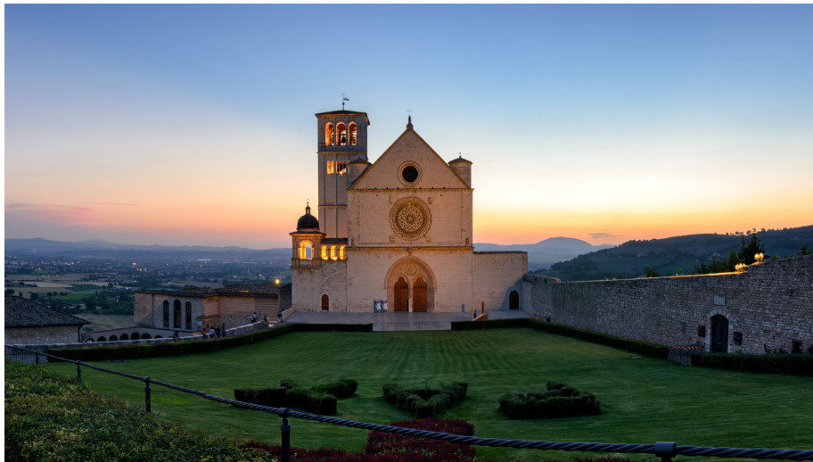
St. Francis of Assisi Basilica