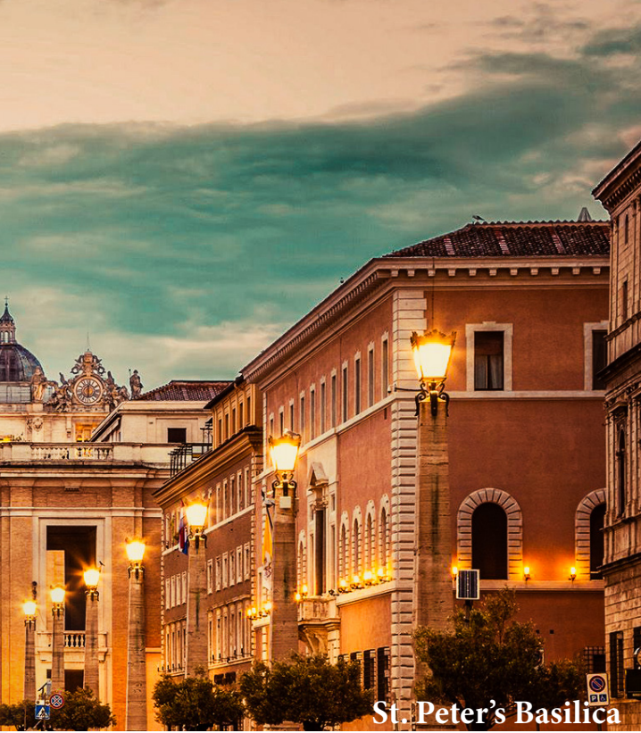
St. Peter's Basilica