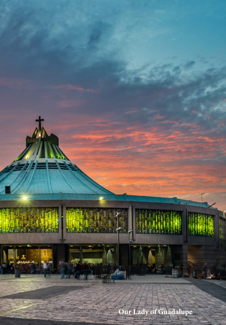
Our Lady of Guadalupe