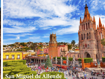
San Miguel de Allende