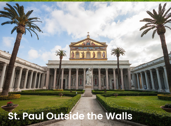
St. Paul Outside the Walls