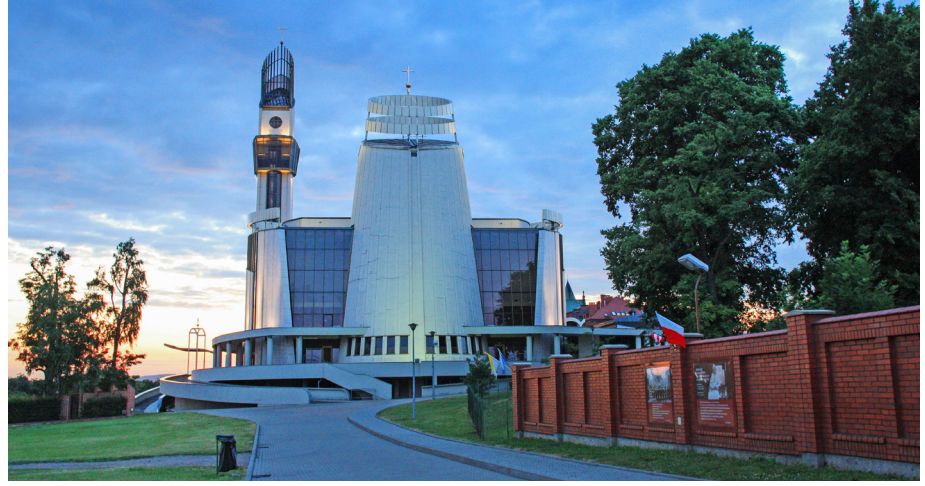
Divine Mercy Shrine, Lagiewniki