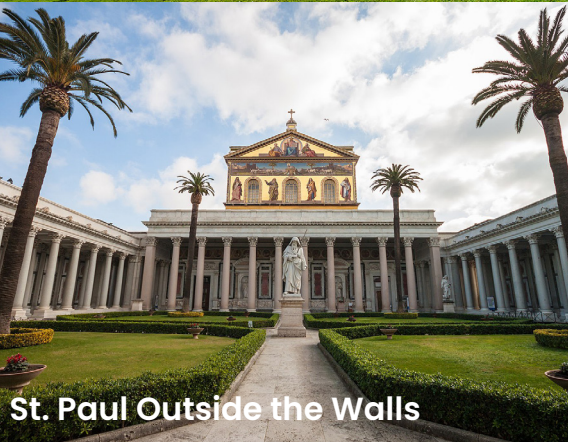
St. Paul Outside the Walls