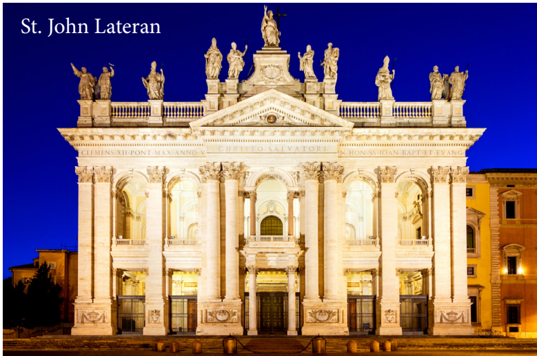
St. John Lateran