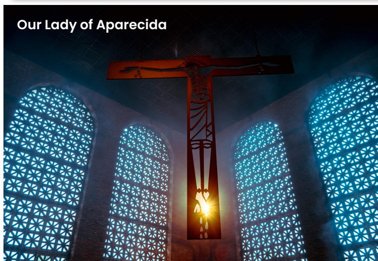
Our Lady of Aparecida