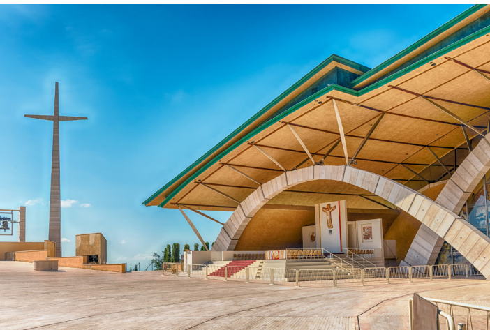
SAN GIOVANNI ROTONDO