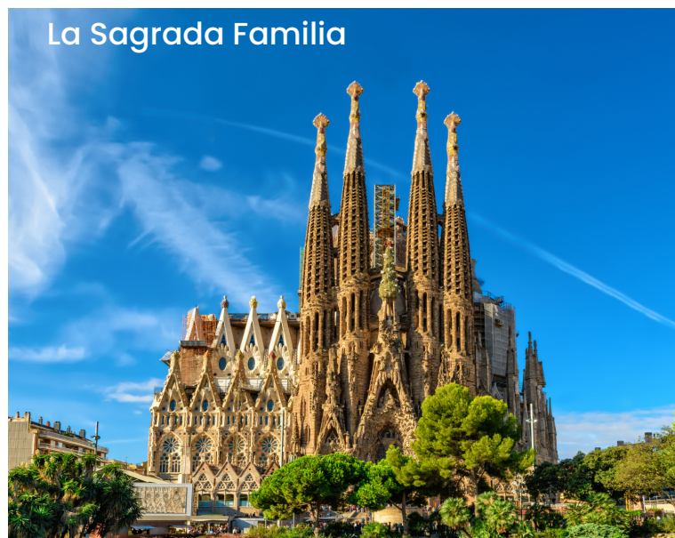
La Sagrada Familia

Transfer to the airport for flight to Newark, with connecting service to Houston.