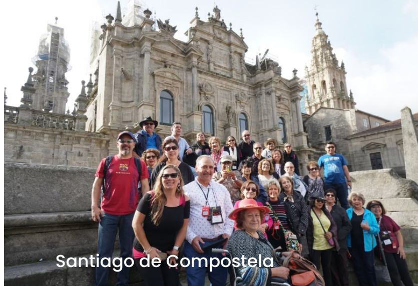
Santiago de Compostela

This morning you will have a walking tour of Lourdes, which will include a visit to Bernadette’s house, the Basilica of the Immaculate Conception, the Miraculous Spring, the Shrine of Bernadette, and the XII century Castle. This afternoon we will participate in the Stations of the Cross. The rest of the day you are free to participate in the different ceremonies or private devotions. After dinner attend the Candle Light Procession. Overnight at your hotel in Lourdes.