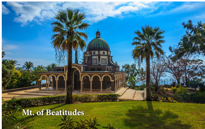
Mt. of Beatitudes

After breakfast, we will return to the Holy Land, traveling to the Jordan River baptismal site to renew our baptismal vows. Next, we will travel through the Jordan Valley to the oasis town of Jericho, the world's oldest city. Next, we will visit the Mt. of Temptation, where Satan tempted Jesus while he fasted for forty days and forty nights. Finally, we will stop for a swim (or float) in the mineral-rich waters of the Dead Sea, renowned for its healing properties. Dinner and overnight accommodations will be at your hotel in Jericho.